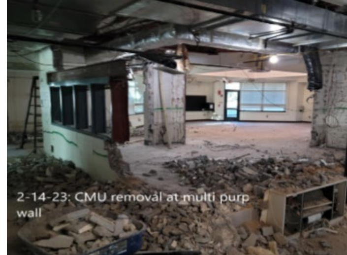
Demolition of CMU Wall for Cafeteria