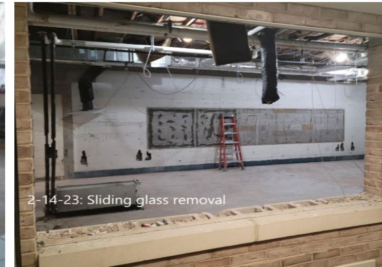
Removal of Glass to Prep for Ongoing Demolition