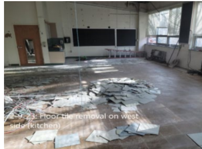
Floor Demolition for Kitchen