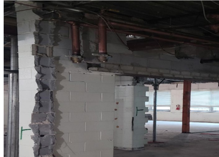
Supply and Return Line for New Kitchen Units