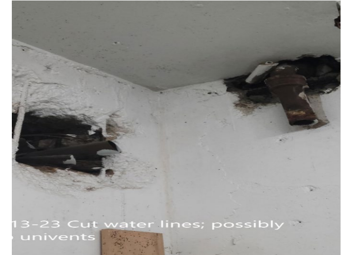
Investigation of Cut Water Lines