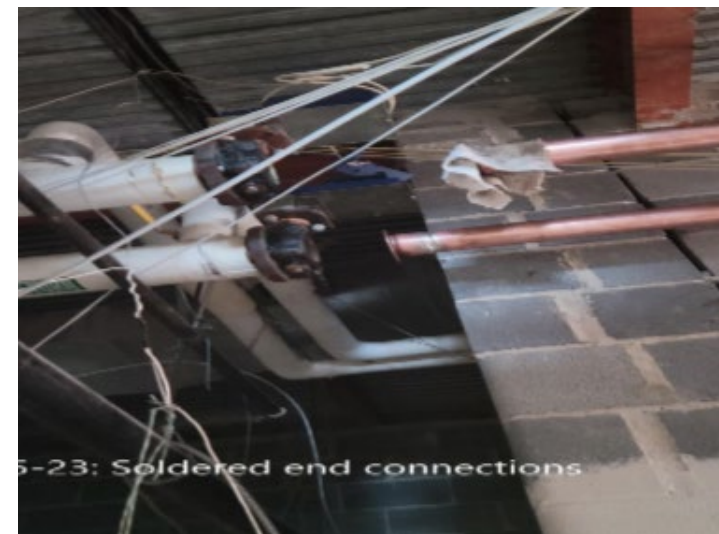
Soldering New HVAC Connections