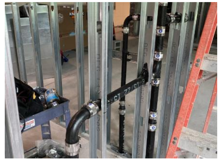
Framing and Plumbing Rough-In