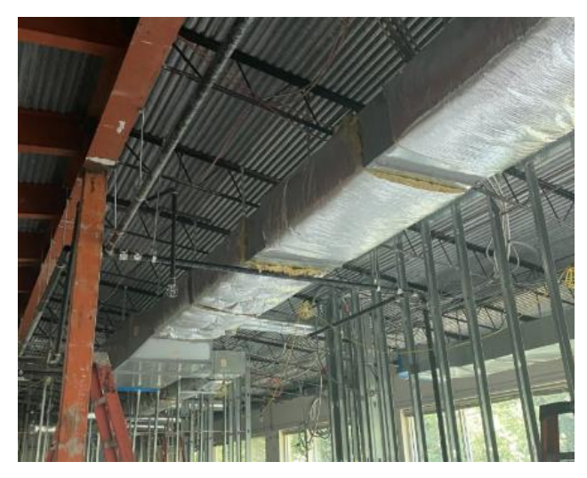
Ductwork installation in kitchen area