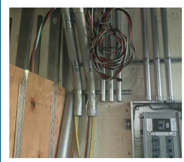
Wire Pull in Kitchen Electronic Closet