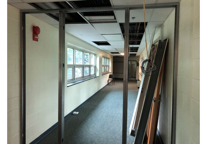
Installation of electrified interior doors has begun