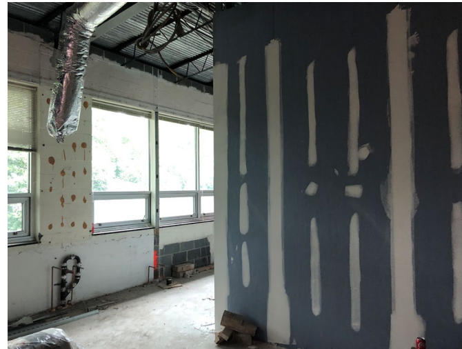
Drywall hanging in kitchen/cafeteria