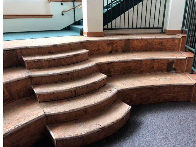
Carpet removal in atrium