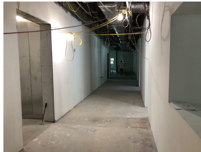
Drywall progress in kitchen/cafeteria