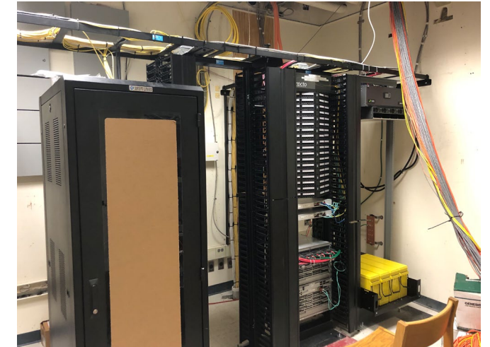
IT Closet equipment installation