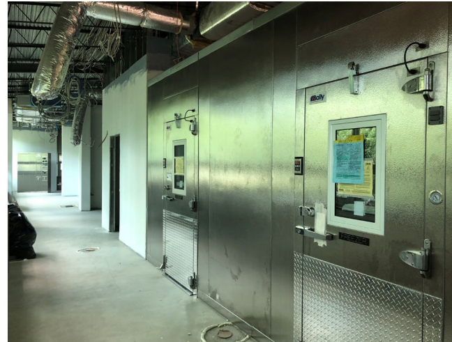
Install of kitchen equipment