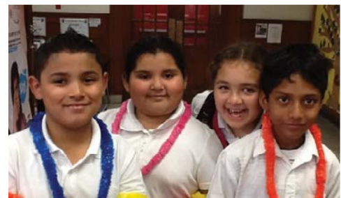
Powell Elementary Dual Language students