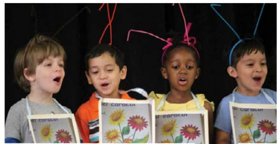
Bancroft Elementary Dual Language students

A Dual Language program provides students at least 50 percent of their instruction in another language. At DCPS, we currently offer Spanish Dual Language programs at 11 schools. Curriculum is designed so that instruction in Spanish builds upon instruction in English and vice versa. Students who complete our Dual Language programs will be bilingual and biliterate, while also achieving academic success and cultural competency.