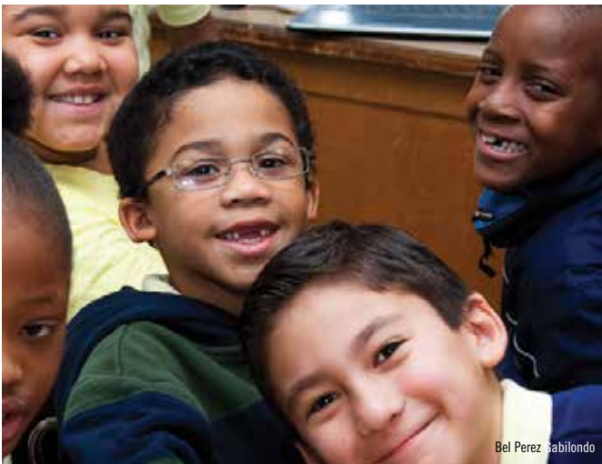
Bel Perez / abilondo