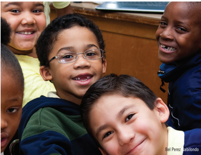
Bel Perez / iablonido